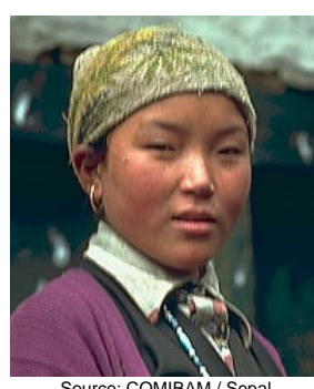
Source: COMIBAM / Sepal

Population: 10,000 World Popl: 176,400 Total Countries: 5 People Cluster: South Asia Buddhist Main Language: Sherpa Main Religion: Buddhism Status: ☀ Frontier Unreached Evangelicals: 0.00% Chr Adherents: 0.00% Scripture: New Testament