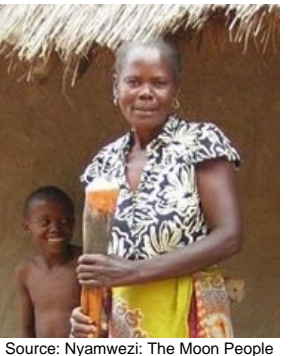
Population: 2,069,000 World Popl: 2,069,000